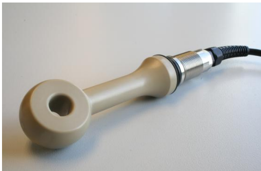
PEEK sensor for PH measurements