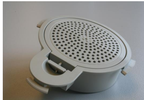
Air filtration unit for mobile oxygen aggregate