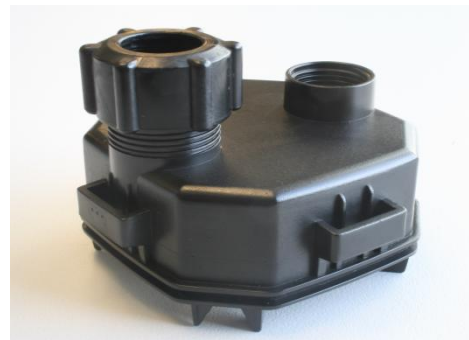
PH sensor connector unit